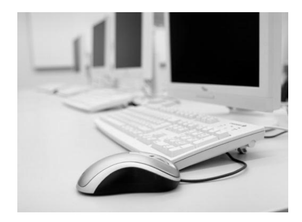
Figure 1: Hardware can benefit your school...

'Technology' includes a large range of different devices such as desktop computers, laptops, mobile phones, smartphones, tablets, projectors, printers, scanners, digital cameras and so on, as well as software, applications and digital resources that make it possible to use these devices. Some of these can be used on their own, with appropriate software; others can be connected to the internet. It is the case that mobile devices are spreading very rapidly in Africa and that they constitute a privileged means of access to the internet, particularly for people who cannot afford a computer. It therefore makes sense to plan around this emerging trend. As a school leader you should try to increase your awareness of technological developments and how they can be harnessed to enhance learning so that you can look for opportunities to provide access to these technologies in your school.