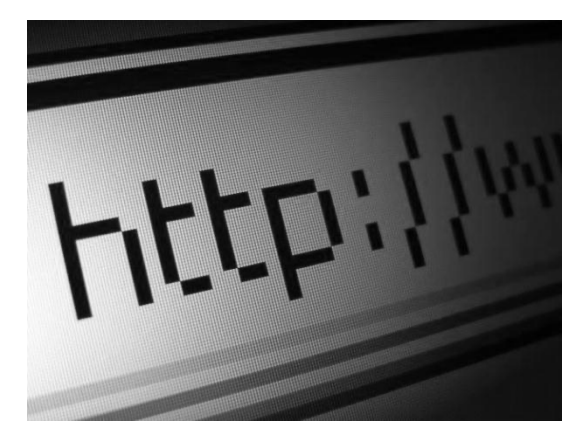
Figure 2: and so can give access to the Internet.